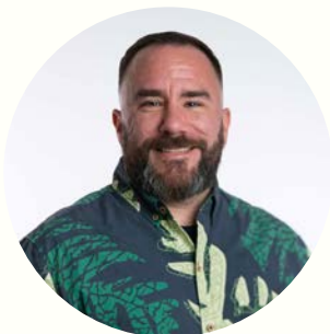
DAN MESTAS COMMUNICATIONS