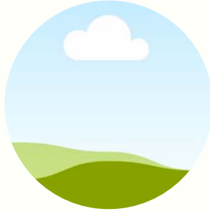
TARA LUM RESEARCH & PROMOTION