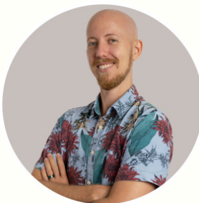
ZZ RIELA SUSTAINABILITY