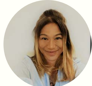
PIKAKE VETERE SUSTAINABILITY