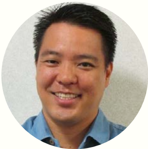
TYSON TOYAMA, PE GOVERNOR