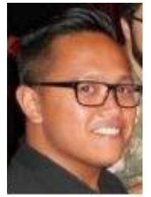
DIAMOND PEDRO ACS SUPPLY CORP.