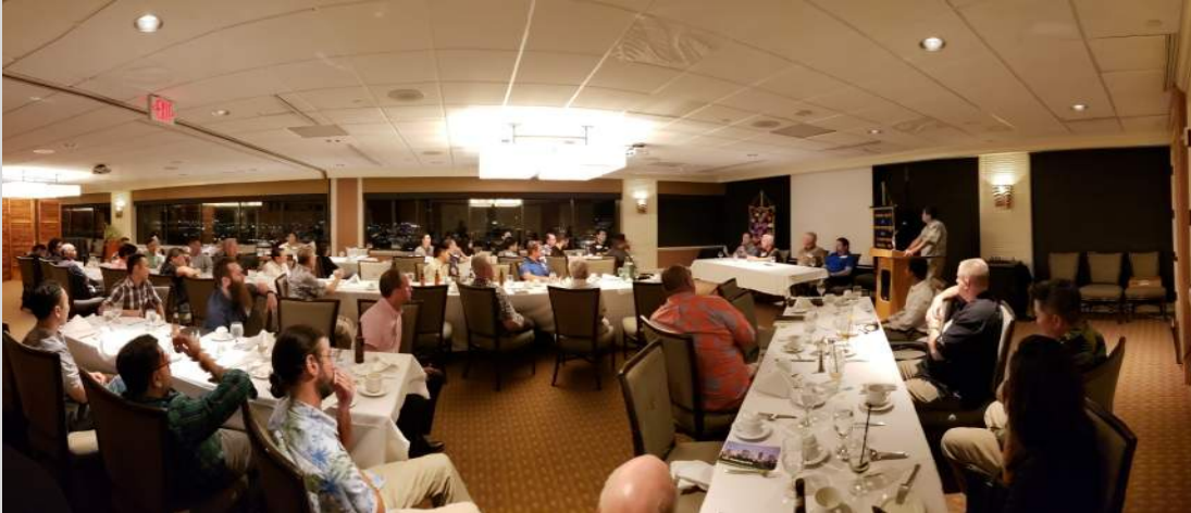
Above: There was a great turnout at the October monthly meeting!