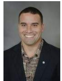
JOSH JACKSON AIR TREATMENT CORP.