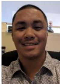
TYSON QUISANO AIR TREATMENT CORP.