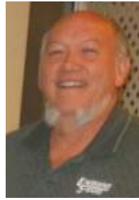
PAUL SCOTT ENGINEERED SYSTEMS